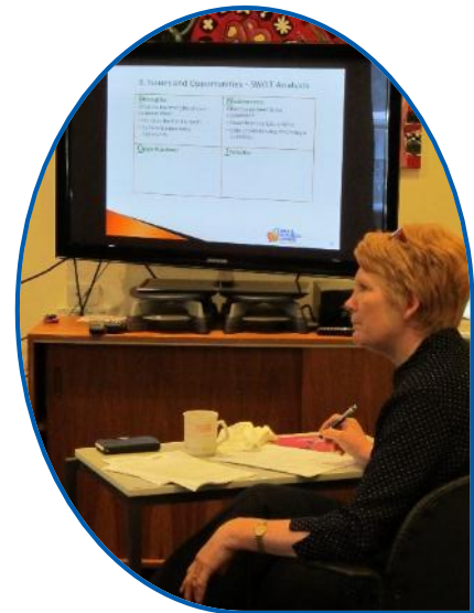
Business Start-Up Seminar