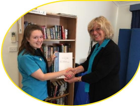
Completion of Certificate III Business Traineeship