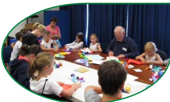
Origami school holiday activity