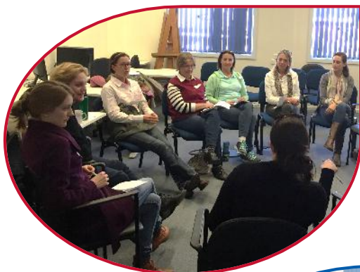
W.I.F.E. information session

"It was also fantastic to see so many community members and visitors wander through the exhibition, resulting in quite a number of pieces sold." A percentage of the art sales proceeds will be put towards community arts projects in the coming year.