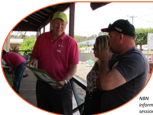
NBN information session

“The practical learning was the best thing about the course”