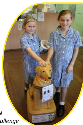
WACRN Guide Dog Challenge

"I like the ability to ask questions and the interaction, it was very practical and a great informative course"