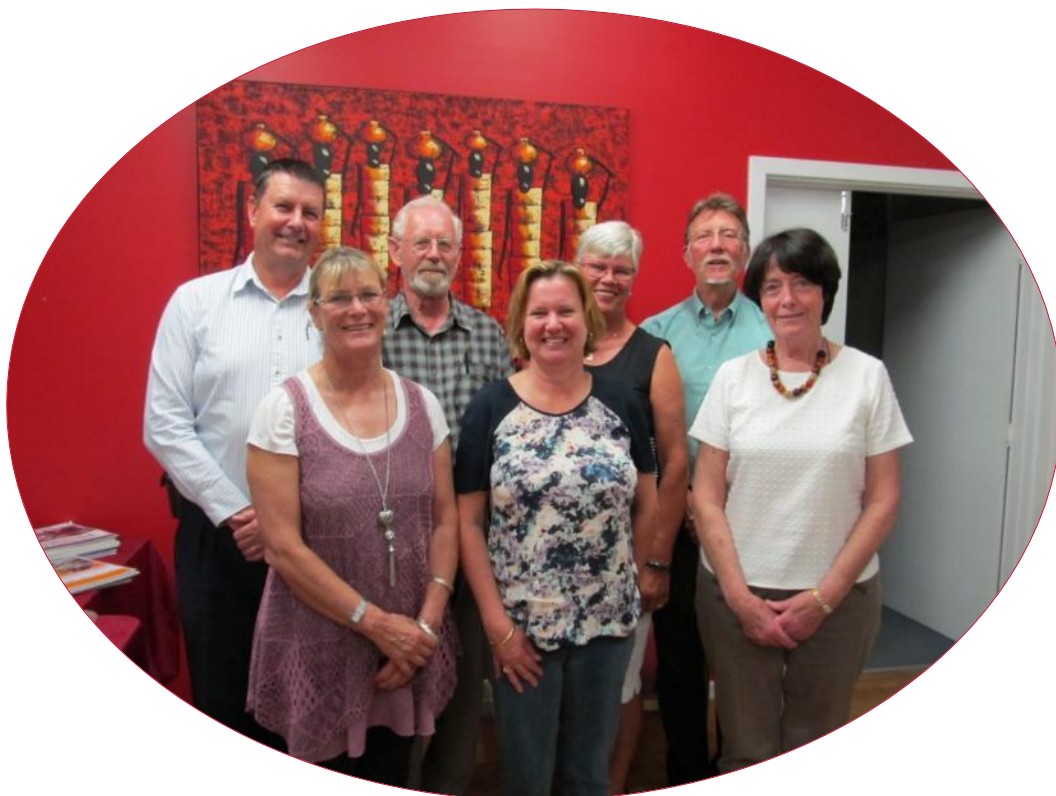
2015-16 Management Committee