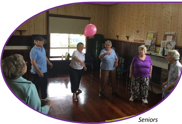
Seniors Week Fun