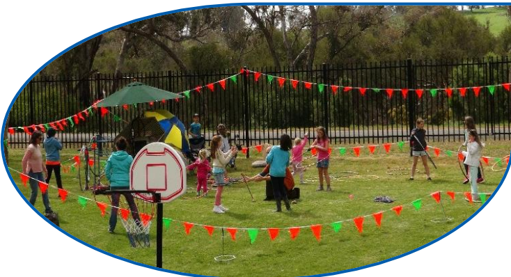
Supporting Mental Health Week