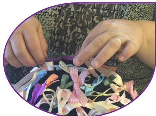
Upcycled Beanie Workshop