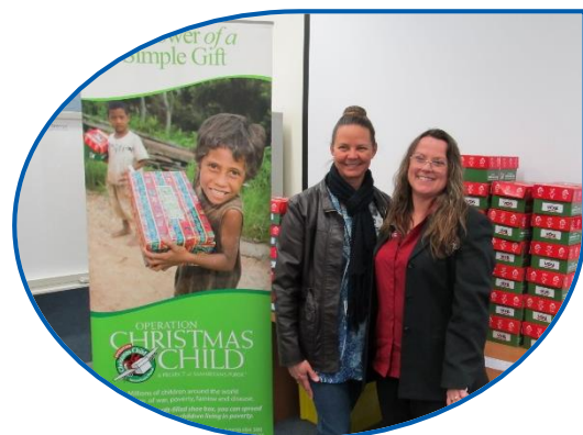
Operation Christmas Child Packing Party