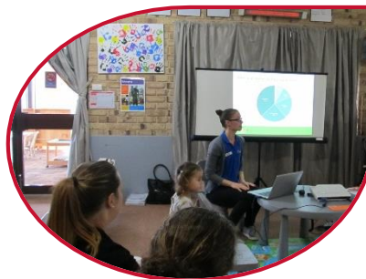
Kidsafe Information Session