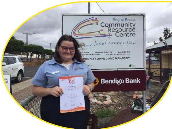
Completion of Certificate III Business Traineeship