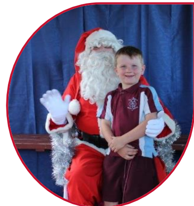
Photos with Santa