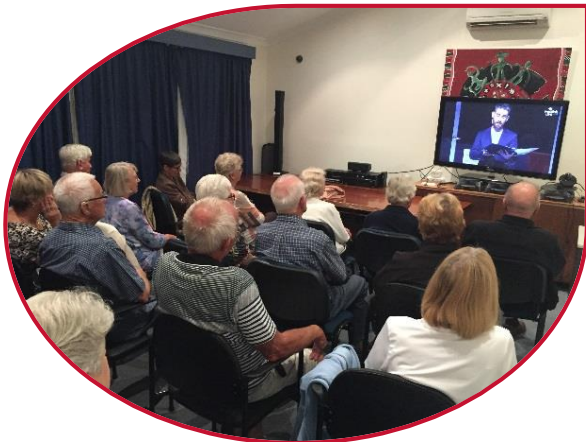
Westlink Simulcast Event