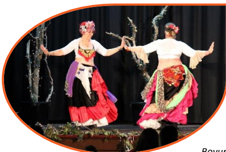
Boyup's Got Talent

“Great for the younger generation to develop and perform in a safe environment”