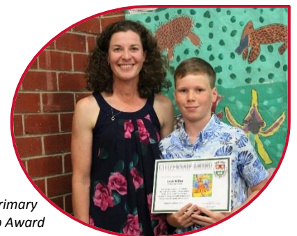
BBDHS Primary Citizenship Award

"I liked learning about how much sugar was in foods and drinks"