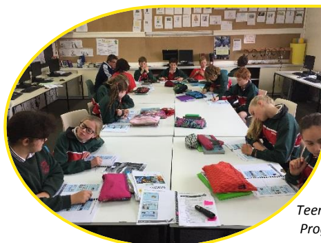
Teen HEAL Wellness Program at BBDHS

Year 7 student, Boyup Brook DHS Participant in the Teen HEAL program