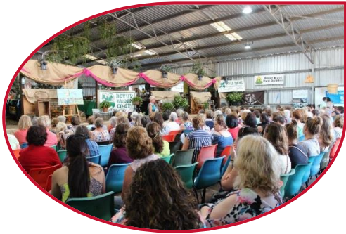
Storm in a Teacup Women's Day