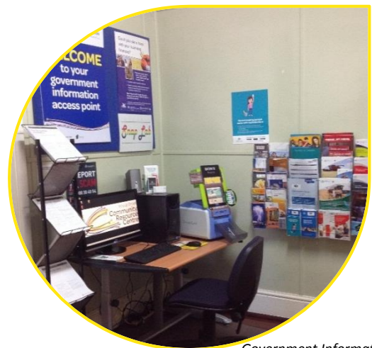
Government Information Access Point