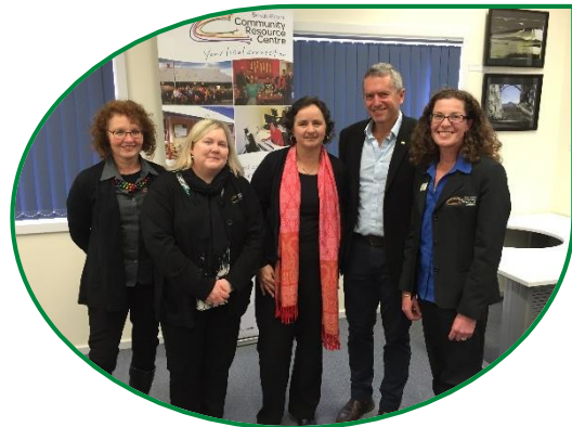
CRC Network Ministerial Funding Announcement