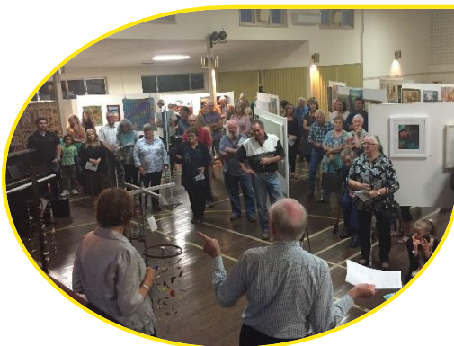
Boyup Brook Art Awards