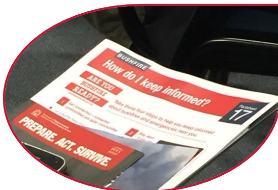
Bushfire Awareness Information Session

More photos from the workshop can be seen on the CRC's website www.boyupbrook.crc.net.au .