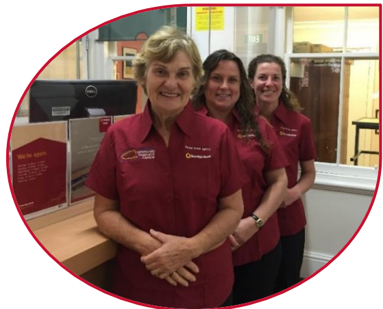
Bendigo Bank Agency