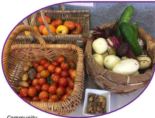
Community Garden Produce