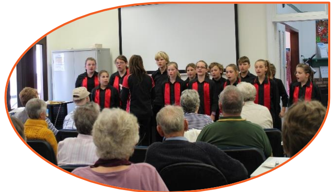
BBDHS Vocal Ensemble performing at Neighbourhood House Week event