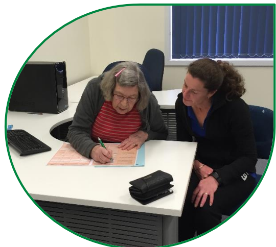
Staff assisting a customer to complete a Government form