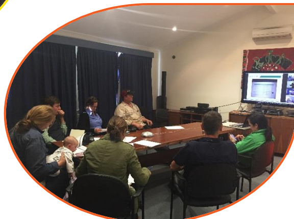
Beef Producer Information Session