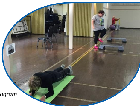
HEAL Wellness Program