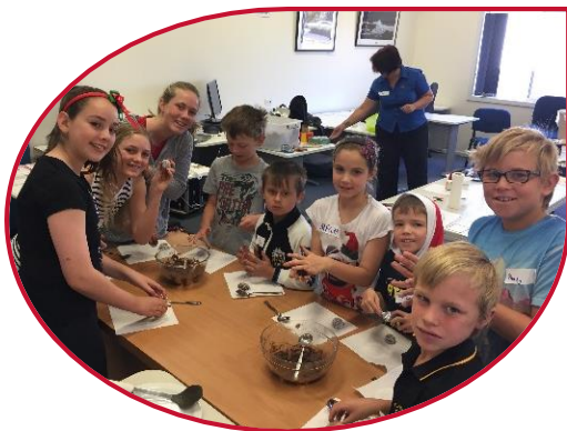
Christmas Craziiness - School Holiday Activity

Feedback received from the ILC Virtual Tour attendees